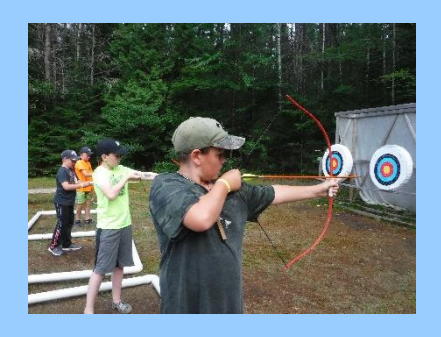
Camp Lau-Ren Open House www.camplau-ren.com