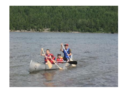
Camp Lau-Ren Open House www.camplau-ren.com